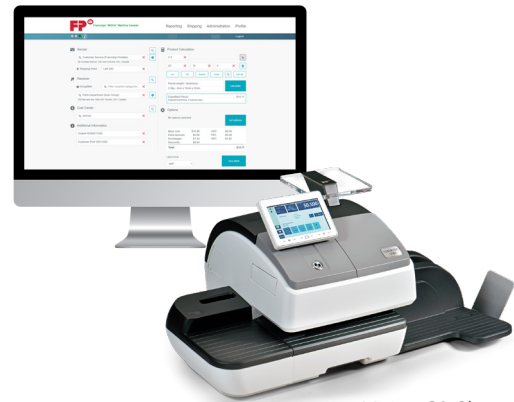
Vision S3 Shown