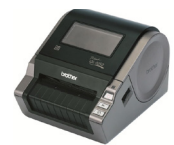
Label Printer (optional)