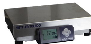
External Scale (optional)