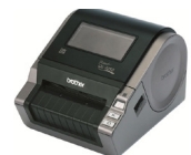
Label Printer (optional)