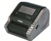
Label Printer (optional)