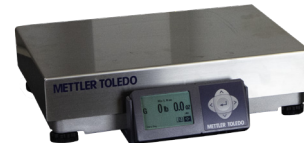
External Scale (optional)