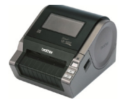
Label Printer (optional)