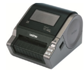
Label Printer (optional)