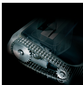
CHAIN heavy duty chain drive system and metal gears