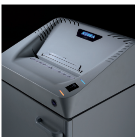
LED INDICATORS Easy to operate ON OFF Reverse switch, with LED signal for bag full or open door