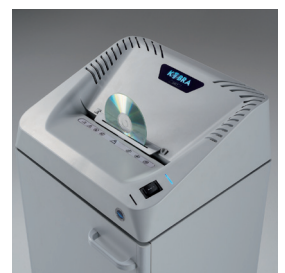
AUTO START & CD SHREDDING Automatic Start/Stop through electronic eyes. Integrated flap for CDs, DVDs, Floppy Disks and Credit Cards shredding