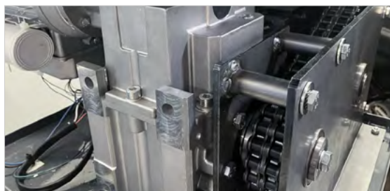
"TITAN-COLOSSUS" GEARMOTOR DRIVE shreds SSDs with metal casings

Touch-screen operating panel: controls are activated by simply touching the intuitive control panel with LED indicators.